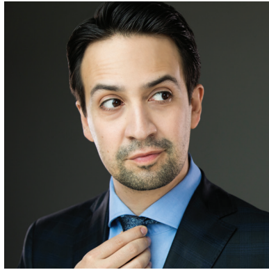
LIN-MANUEL MIRANDA EDUCATION IMPACT AWARD